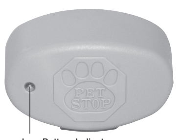
Low Battery Indicator