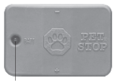
Low Battery Indicator

Remove this cover using a flat-ended screwdriver or coin to replace the battery.